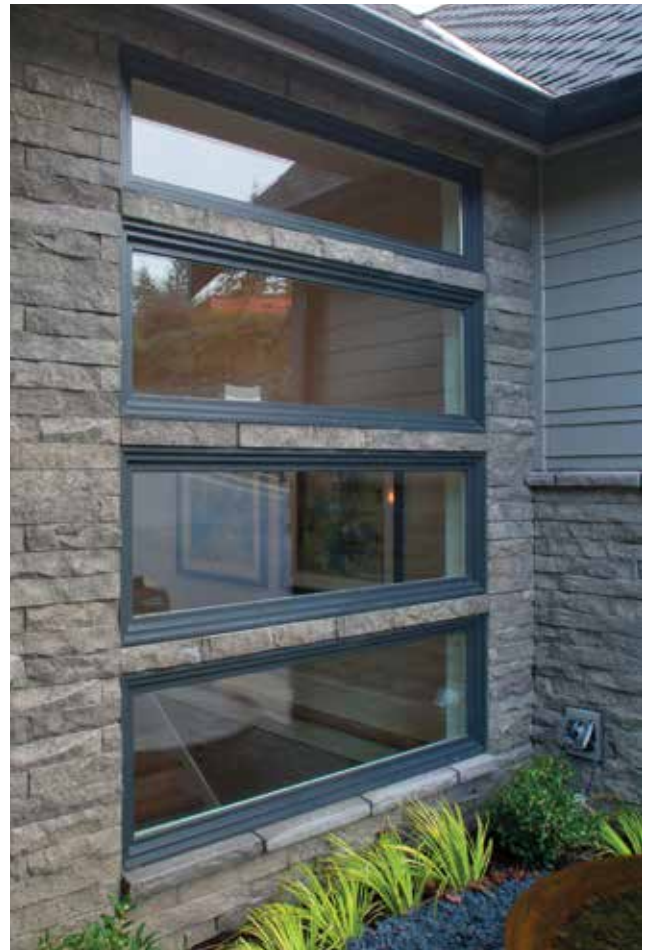
Tuscany Series shown in Bronze