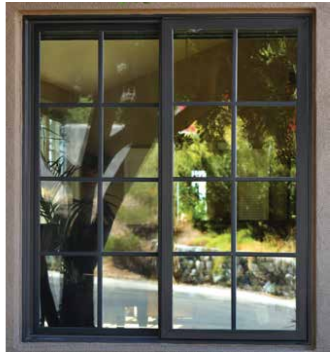
Style Line Series shown in Bronze

*Fog is only available on SDL grids. Fog Grids Between the Glass styles are not available.