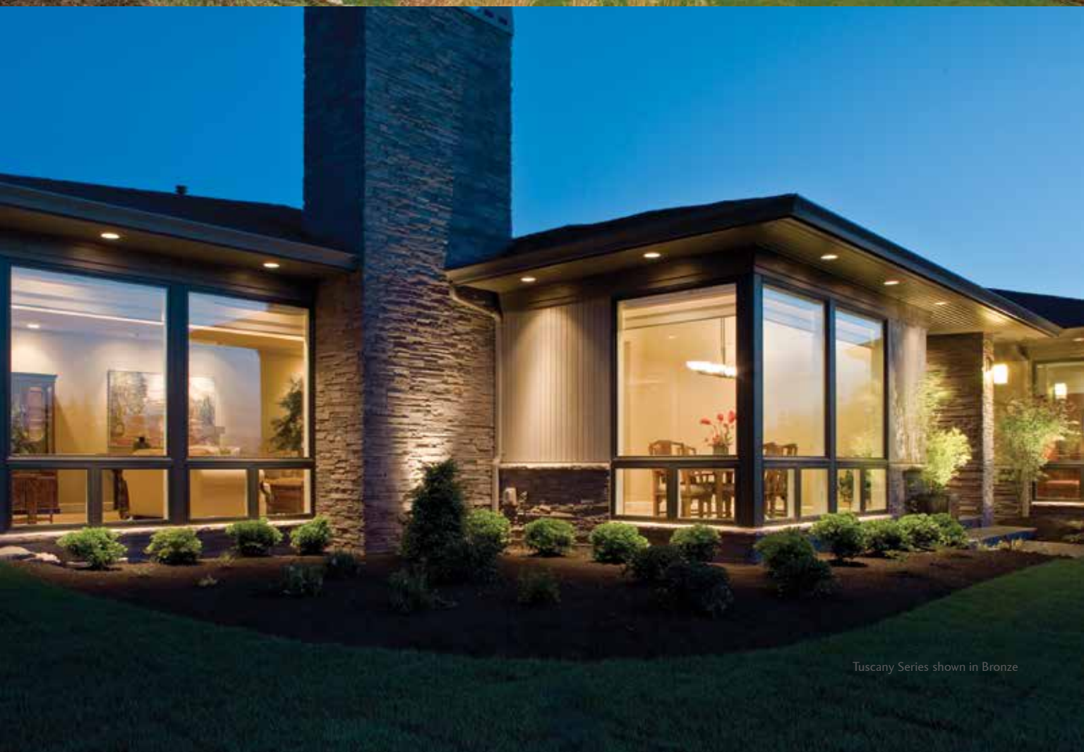
Tuscany Series shown in Bronze