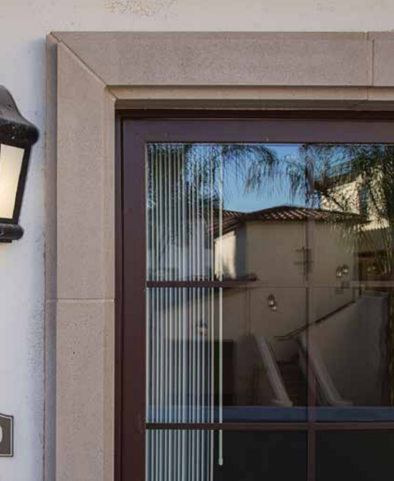
Montecito Series shown in Espresso