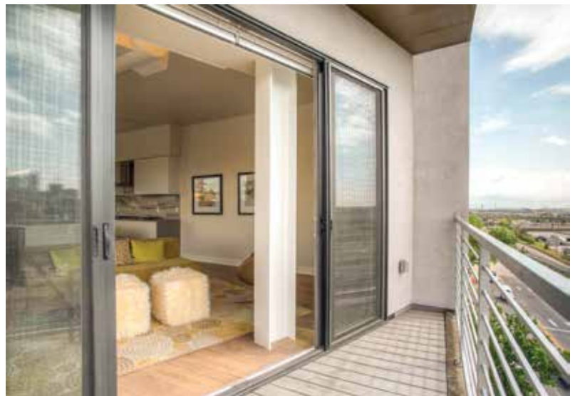
Tuscany Series shown in Tweed

We test for Crosshatch Adhesion, Direct Impact, Humidity Resistance, Cold Crack, Oven Aging and other tests per AAMA 615-13 guidelines. This testing assures you that our Premium Vinyl Finish will stand up to heat, cold, humidity, impact, and weather for years to come.