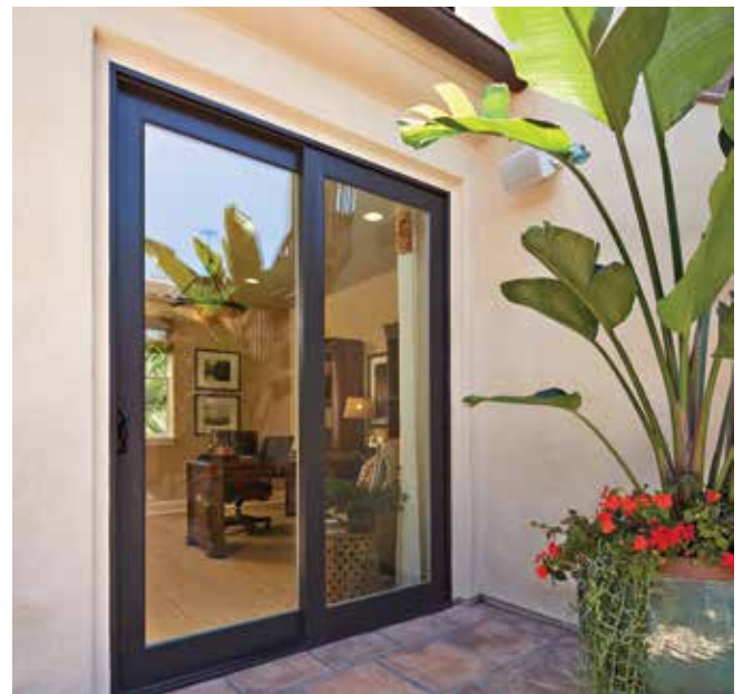
Tuscany Series sliding door shown in Classic Brown