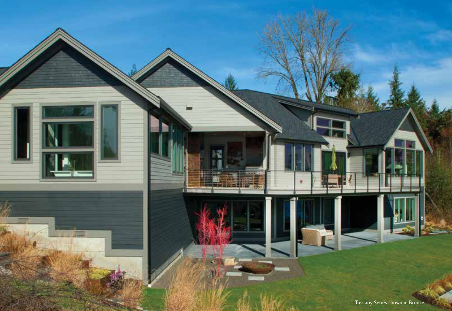
Tuscany Series shown in Bronze